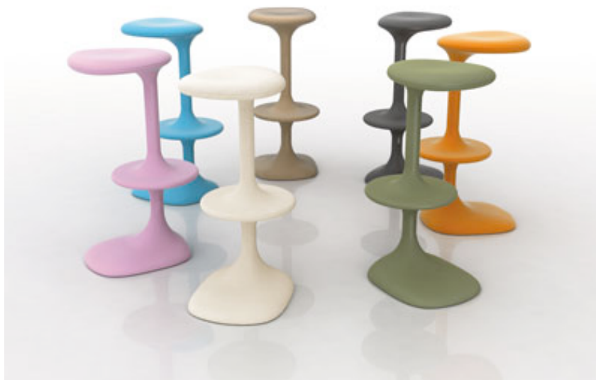
Kant stool, designed by Karim Rashid 2006 Architonic ID 1057283

Registration is free, but please register: tsturm@mpiwg-berlin.mpg.de